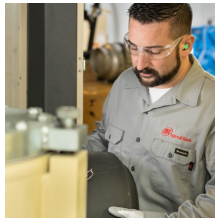
Field Overhaul Services