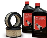
Small Reciprocating Start-Up Kits