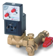
Electronic Drain Valves