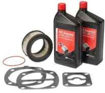
Small Reciprocating Maintenance Kits