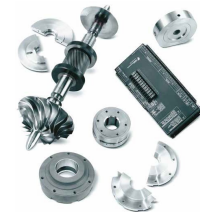
MSG® TURBO-AIR® Centrifugal Compressor Replacement Parts