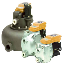
ReliaDrain Zero-Loss Condensate Removal