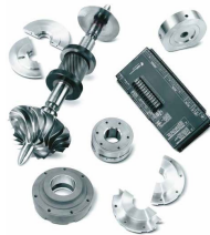
MSG TURBO-AIR Centrifugal Compressor Replacement Parts