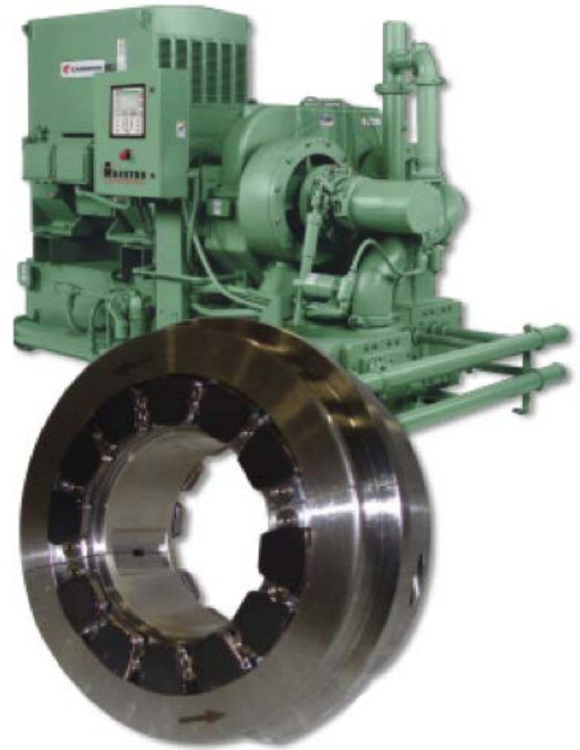
MSG TURBO-AIR 3000

The Polyketone surface is also highly resistant to contamination and corrosion, enabling reliable operation in harsh environments. Bearing reliability is further enhanced by directed lubrication channels that deliver an optimized supply of TurboBlend™ 46 lubricant to key areas of the bearing.